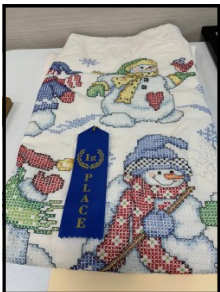
1st Place - Lou