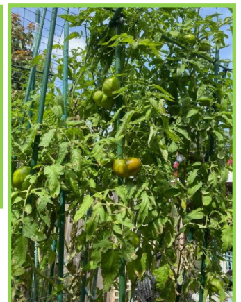
Tomatoes on the vine