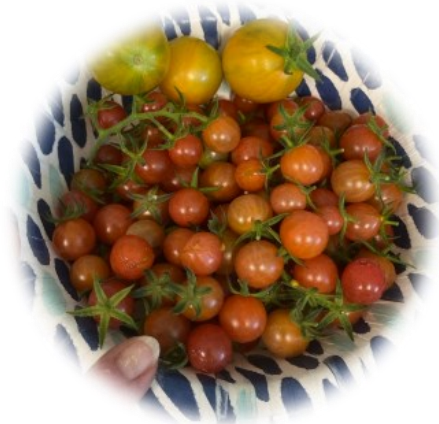
All picked in one day

Until next time, signing off... Dirty Martha 🍷