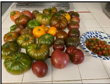
Left: Variety of tomatoes from Martha's garden - picked fresh and delicious!