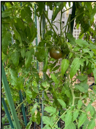
Below: If you look closely you can see the tomatoes nestled in plants over 10 feet tall!